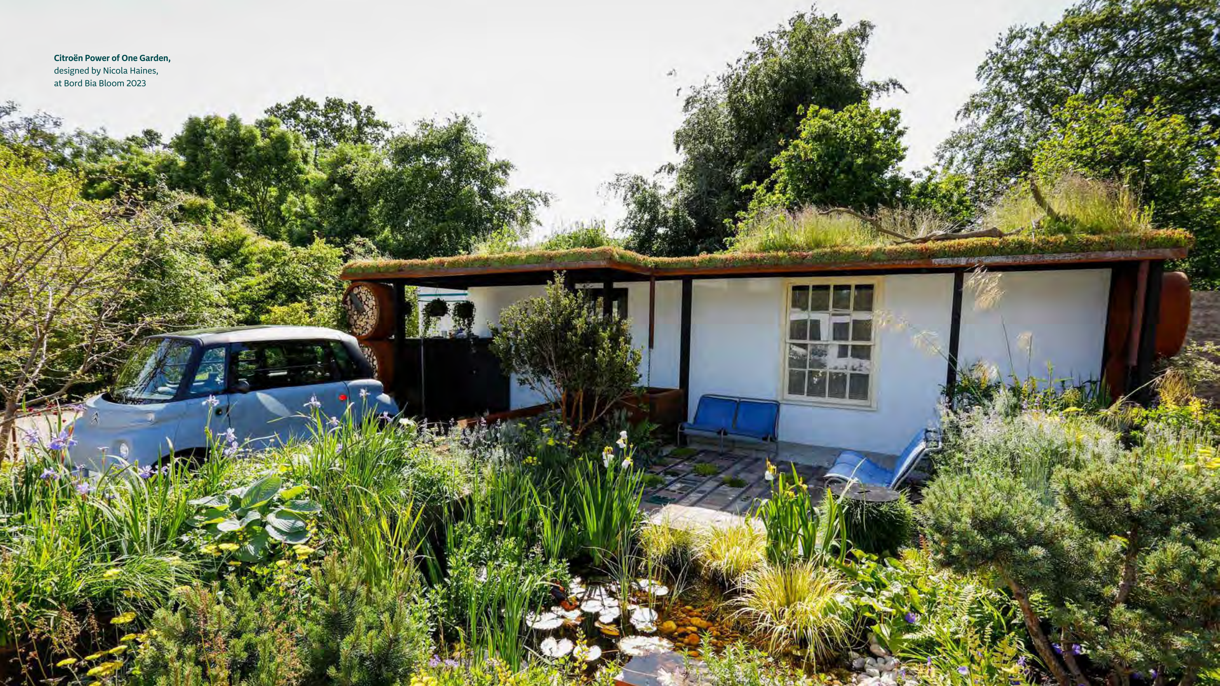
Citroën Power of One Garden, designed by Nicola Haines, at Bord Bia Bloom 2023